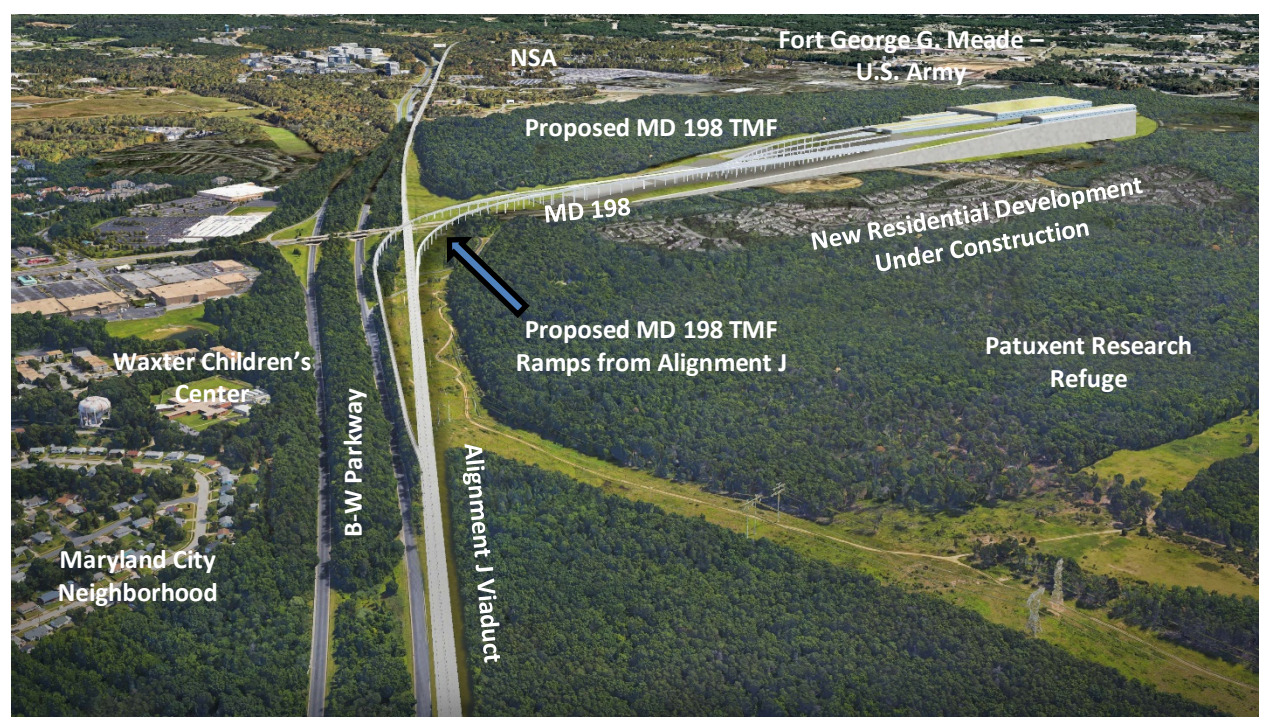
Figure 4.9-15: CAAs #10 and #12 - Illustrative Rendering of Proposed MD 198 TMF and Corresponding Ramps with Alignment J near Patuxent Research Refuge, Fort George G. Meade, and NSA, Looking North