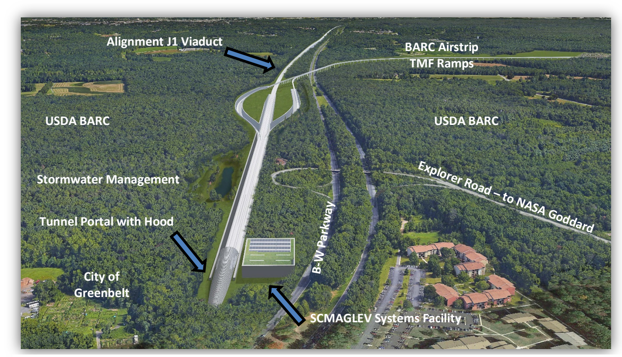
Figure 4.9-4: CAAs #5, #6, #7, #8, #9 – Illustrative Rendering of Alignment J1 Tunnel Portal at Explorer Road Interchange with Ramps to BARC Airstrip TMF, Looking North