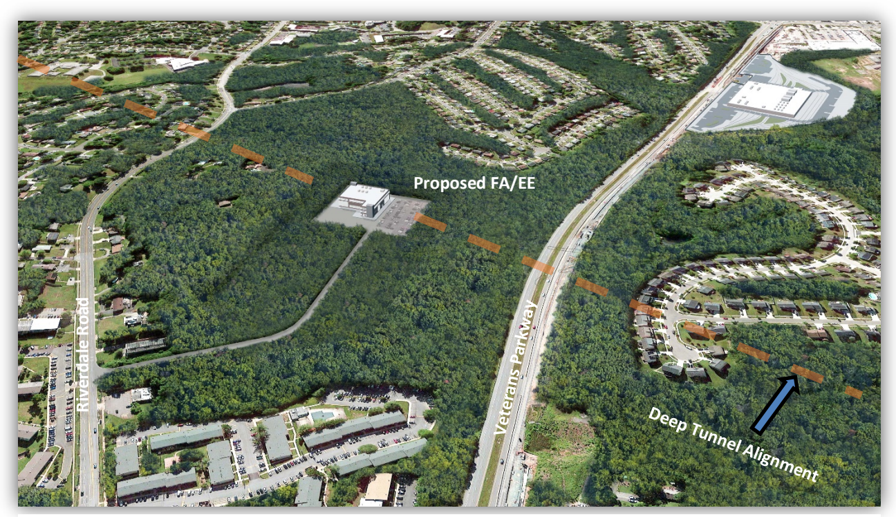
Figure 4.9-2: CAA #4 – Illustrative Rendering of FA/EE Proposed in New Carrollton, Looking East

The Build Alternatives J and J1 alignments transition from tunnel to viaduct in the vicinity of the National Aeronautics and Space Administration (NASA) Goddard Space Flight Center's (GSFC) Explorer Road interchange with the BWP. They run through the City of Greenbelt Historic District and they pass over BARC, Beaver Dam Road, Powder Mill Road, past the US Secret Service James J. Rowley Training Center and head north through South Laurel and past Woodbridge Crossing and Montpelier Hills. These resources in the CAAs #5, #6, #7, #8, #9 viewsheds would experience moderate to higher level degrees of visual impact. See Figures 4.9-3 and 4.9-4 .