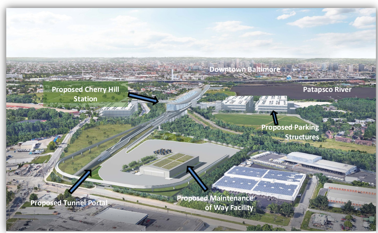
Figure 4.9-10: CAAs #18 and #19 - Illustrative Rendering of Proposed Cherry Hill Station, Tunnel Portal, Maintenance of Way Facility, and Parking Structures, Looking North