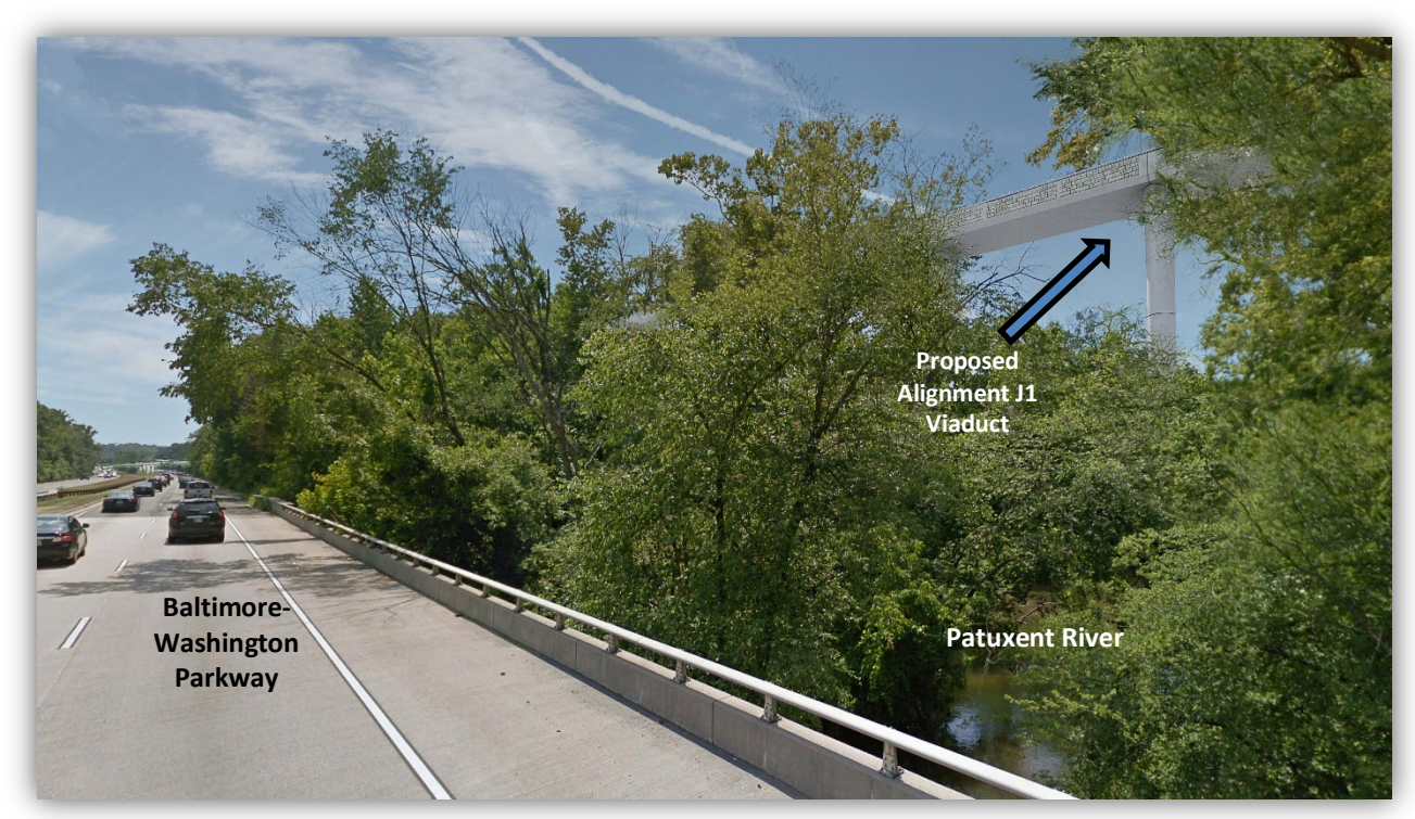
Figure 4.9-5: CAA #11 and #12- Illustrative Rendering of Proposed Build Alternative J1 Parallel to Southbound BWP Crossing the Patuxent River, Looking Southwest

In Anne Arundel County, the Build Alternatives viaducts would continue to be carried at high elevations (between 30 feet and 130 feet high, depending upon the existing topography) adjacent to the BWP and would present potential visual impacts to surrounding resources like Maryland City Park, the Patuxent River and Patuxent River Park, and PRR. Through Anne Arundel County the Build Alternatives J alignments continue to the east of the BWP at higher elevations and transitions back to deep tunnel at Fort Meade. Similarly, the Build Alternatives J1 alignments continue to the west of the BWP and transitions back to deep tunnel at Maryland City Park adjacent to Brock Bridge Elementary School. Under the Build Alternatives J alignments, FRA determined the resources in CAAs #10, #11, and #12, specific to Patuxent River and Patuxent River Park, PRR, and BWP would experience a higher-level degree of visual impact, due to the undisturbed and natural landscape. Under Build Alternatives J1 alignments, FRA determined theses same resources for Patuxent River, PRR, Maryland City Park, and BWP would experience moderate to higher level degrees of visual impact, due to the location of the viaduct through park-like and neighborhood resources. Figure 4.9-5 provides an illustrative rendering of the proposed Build Alternative J1 viaduct crossing the Patuxent River.