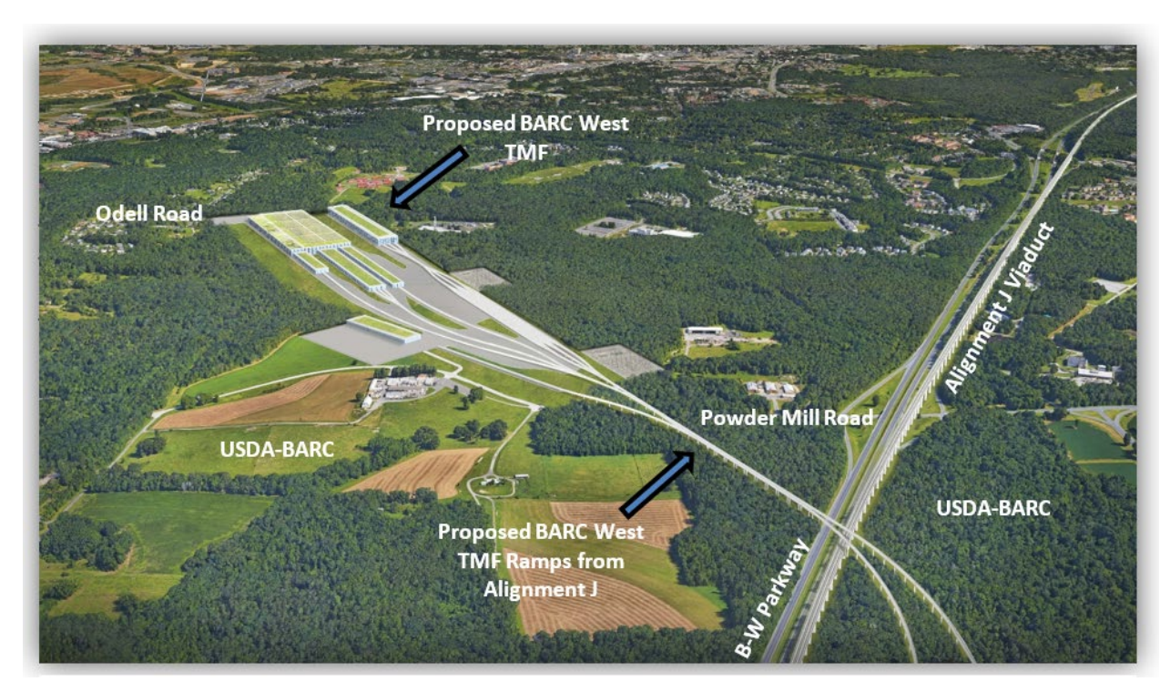
Figure 4.9-13: CAAs #5, #6, and #8 - Illustrative Rendering of Proposed BARC West TMF and Corresponding Ramps with Alignment J, Looking North