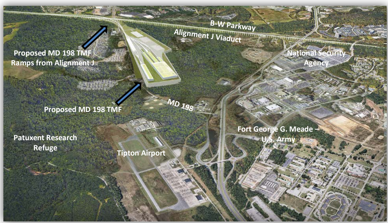
Figure 4.9-14: CAAs #10, #11, and #12 - Illustrative Rendering of Proposed MD 198 TMF and Corresponding Ramps with Alignment J near Tipton Airport, Fort George G. Meade, and NSA, Looking West

Access ramps associated with Build Alternatives J alignments run parallel along the east side of the BWP through the PRR property. FRA determined that these ramps would within CAA's #10, #11, and #12, result in a high-level degree of visual impact to the BWP and the PRR. Similarly, the ramps associated with the Build Alternatives J1 alignments run parallel along the west side of BWP and cross over the BWP at MD 198 to reach the TMF. The TMF and associated ramps would also cause higher level degrees of visual and light emission impacts on the adjacent DC Children's Center-Forest Haven District, Tipton Airport, PRR, Fort George G. Meade, and residential communities of Sudlersville South, Maryland City, Watershed and Welchs Court within CAAs #10 and #12. The MD 198 TMF would also be highly noticeable to the motoring public travelling on MD 198 and the BWP. Figures 4.9-14 and 4.9-15 below provide illustrative renderings of the proposed MD 198 TMF and contributing elements.