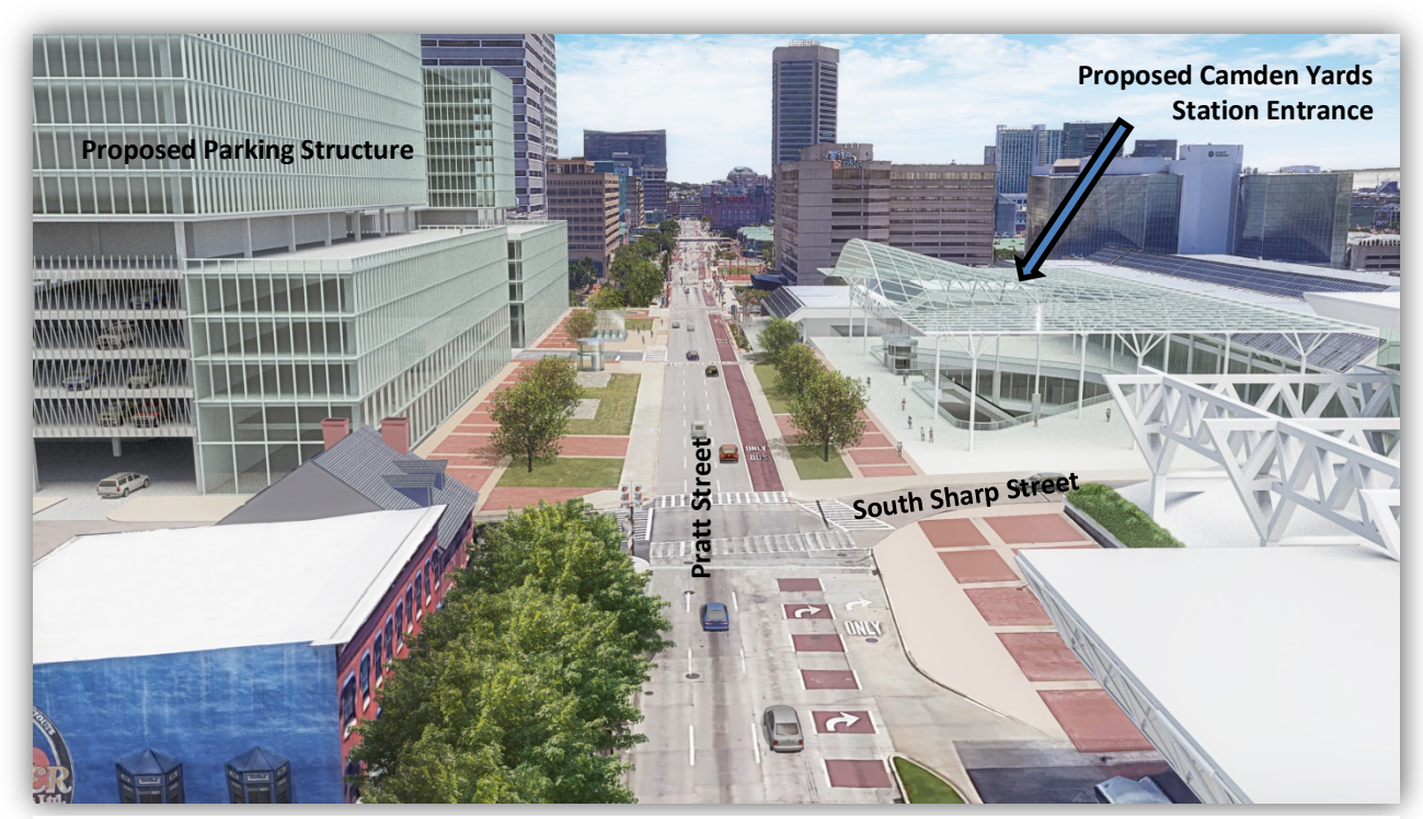
Figure 4.9-11: CAA #20 - Illustrative Rendering of Proposed Station near Camden Yards in Downtown Baltimore on Pratt Street, Looking East