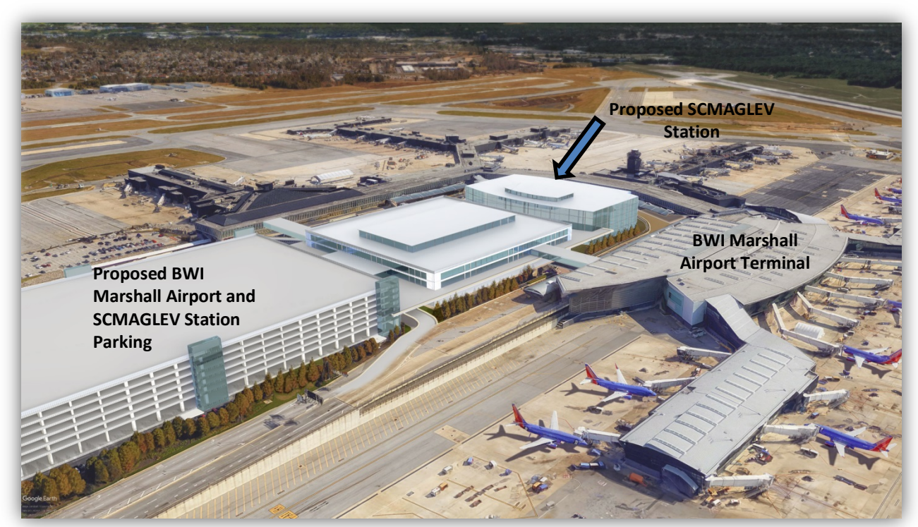
Figure 4.9-9: CAA #16 - Illustrative Rendering of Proposed Station at BWI Marshall Airport – Parking Garage and Terminal, Looking East

7460), MDOT MAA and BWI Marshall Airport lighting policies and will receive agency approvals prior to construction. Therefore, FRA has determined that the proposed station within the CAA #16 viewshed would have a relatively imperceptible to lower level degree of visual impact. Figure 4.9-9 provides an illustrative rendering of the proposed BWI Marshall Airport station and contributing elements.