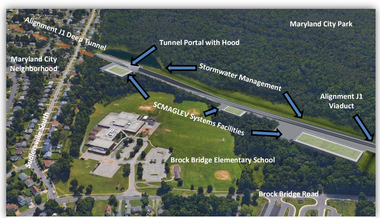
Figure 4.9-6: CAA #10 - Illustrative Rendering of Proposed Build Alternative J1 Tunnel Portal near Brock Bridge Elementary School and Maryland City, Looking East

In addition, other sensitive resources, such as Maryland City Park, Patuxent River Park, Brock Bridge Elementary School, and Thomas J.S. Waxters Children's Center near the Maryland City, Sudlersville South and Barbersville communities fall within the viewshed for the Build Alternatives J and J1 alignments; however, these resources are at a distance where existing topography and vegetation would only partially shield/block the Build Alternative structures and lights. For Build Alternatives J1 alignments in this area, FRA determined impacts to these resources in CAAs #10, #11, and #12 would experience higher level degrees of visual impacts, depending upon relative distance and elevation of existing and proposed features. For these same CAAs, Build Alternatives J alignments would have relatively imperceptible visual impacts. Figure 4.9-6 provides an illustrative rendering of the proposed Build Alternatives J1 tunnel portal and contributing elements.