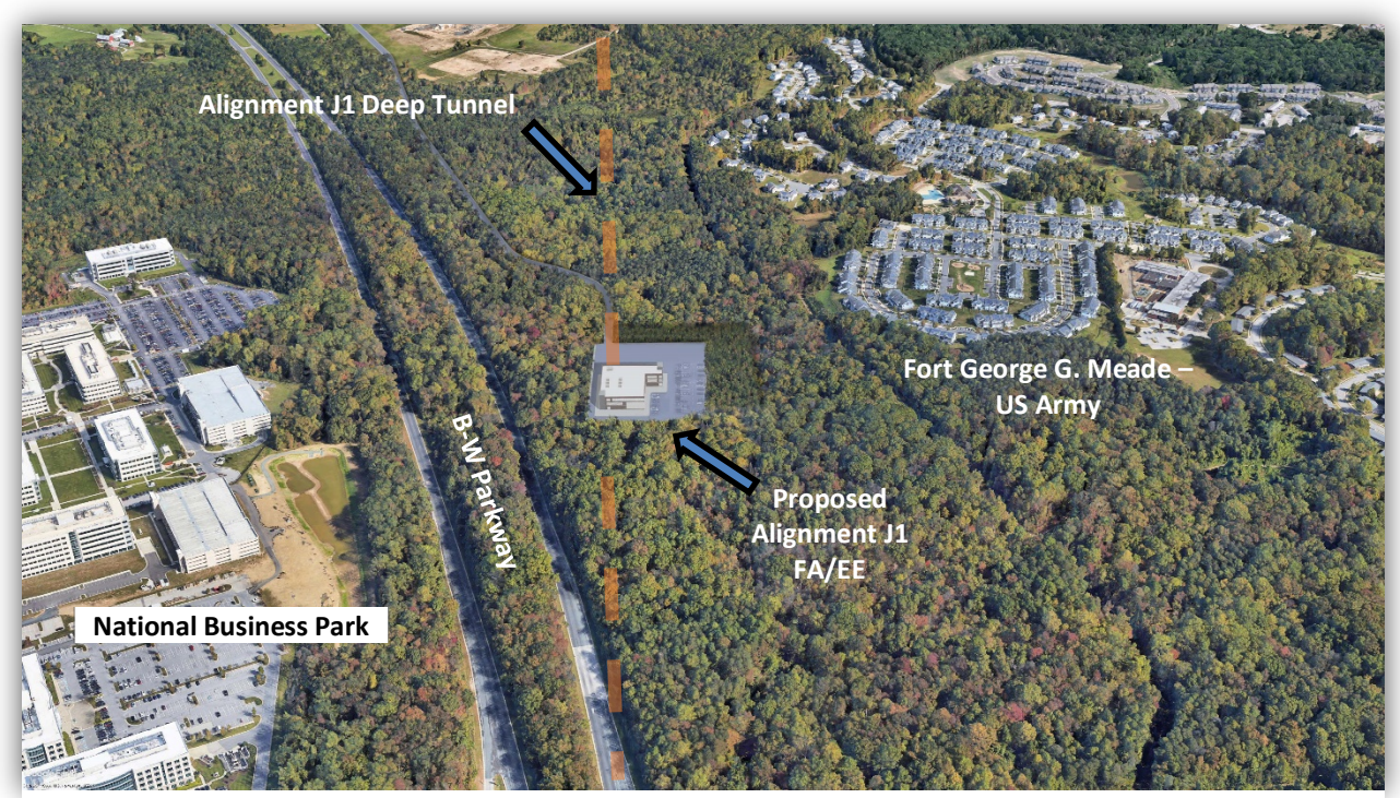
Figure 4.9-7: CAA #13 - Illustrative Rendering of Proposed Alignment J1 FA/EE near Fort George G. Meade and Baltimore-Washington Parkway, Looking North

northwestern portion of the PRR and adjacent to the BWP. FRA determined the viaduct would result in a higher-level degree of visual impact to those resources in CAAs #10 and #12. The viaduct would comply with Federal Aviation Administration (FAA) Notice of Proposed Construction or Alteration (FAA-7460), Maryland Department of Transportation/Maryland Aviation Administration (MDOT MAA) regulations for safe operations due to its close proximity to Tipton Airport. Figure 4.9-7 provides an illustrative rendering of the proposed FA/EE near Fort George G. Meade.