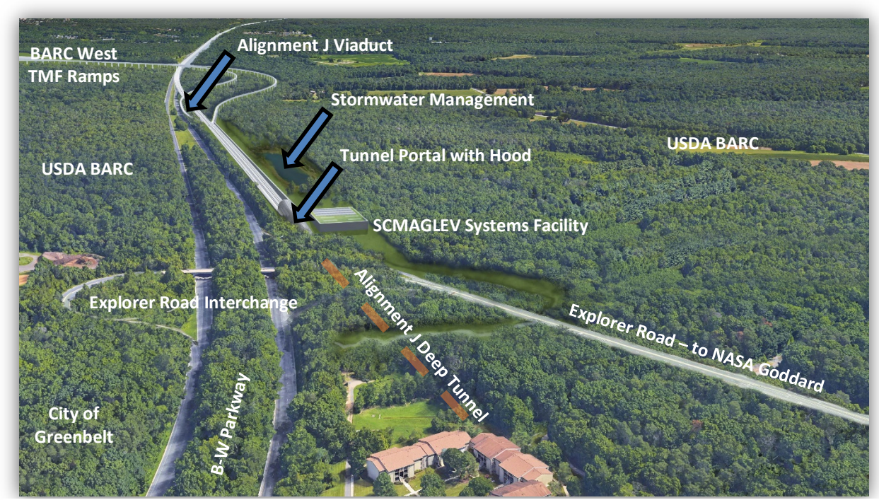
Figure 4.9-3: CAAs #5, #6, #7, #8, #9 – Illustrative Rendering of Alignment J Tunnel Portal at Explorer Road Interchange with Ramps to BARC West TMF, Looking North