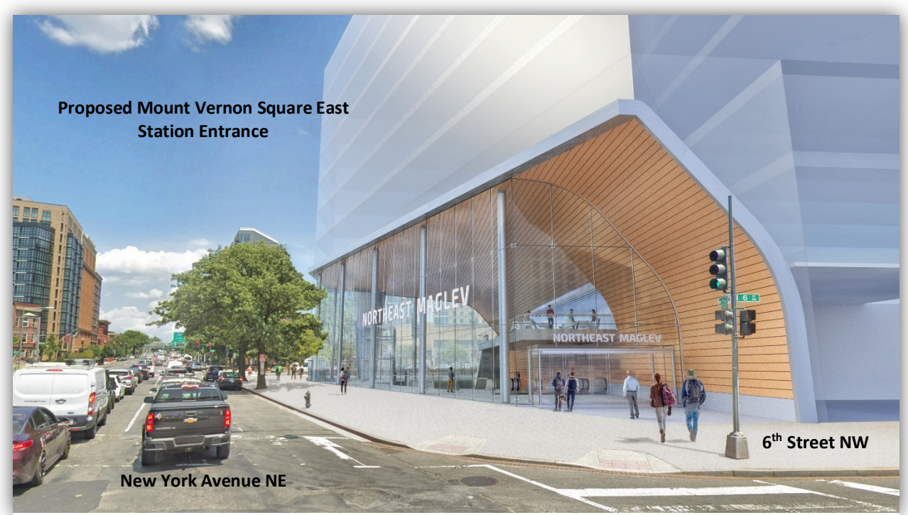
Figure 4.9-8: CAA #1 - Illustrative Rendering of Possible Entrance to Proposed Mount Vernon Station, Looking Northeast

Head house entrance structures would introduce new visual elements to the existing area. The new buildings will be designed to be architecturally cohesive with the surrounding neighborhood, with contemporary accents and facility lighting that could be built separately and/or integrated into neighboring structures. The introduction of these conforming structures into the existing visual landscape would not introduce disproportional visual impacts or light emissions within the CAA #1 viewshed as the proposed buildings would merge with the existing surroundings and not disrupt any sensitive views. Therefore, the degree of visual and light emission impacts is categorized by FRA as lower to moderate . Figure 4.9-8 provides an illustrative rendering of the proposed Mount Vernon Square East Station Entrance.